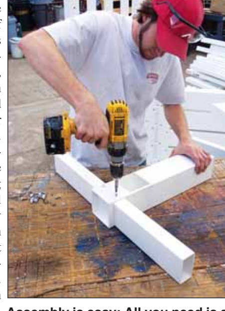
also offers Assembly is easy: All you need is a tremendous screwdriver or cordless drill.

terial called Duralon. unique blend polymers that is superior to wood, which can rot and splinter during use. It adds flexibility while maintaining exceptional integrity and strength against breaking under impact. Duralon resistance