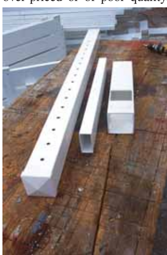
Pieces fit perfectly, sliding and continued deinto precut pockets. and I owned and

In 1985, I found that most jumps available were over-priced or of poor quality. I started building my